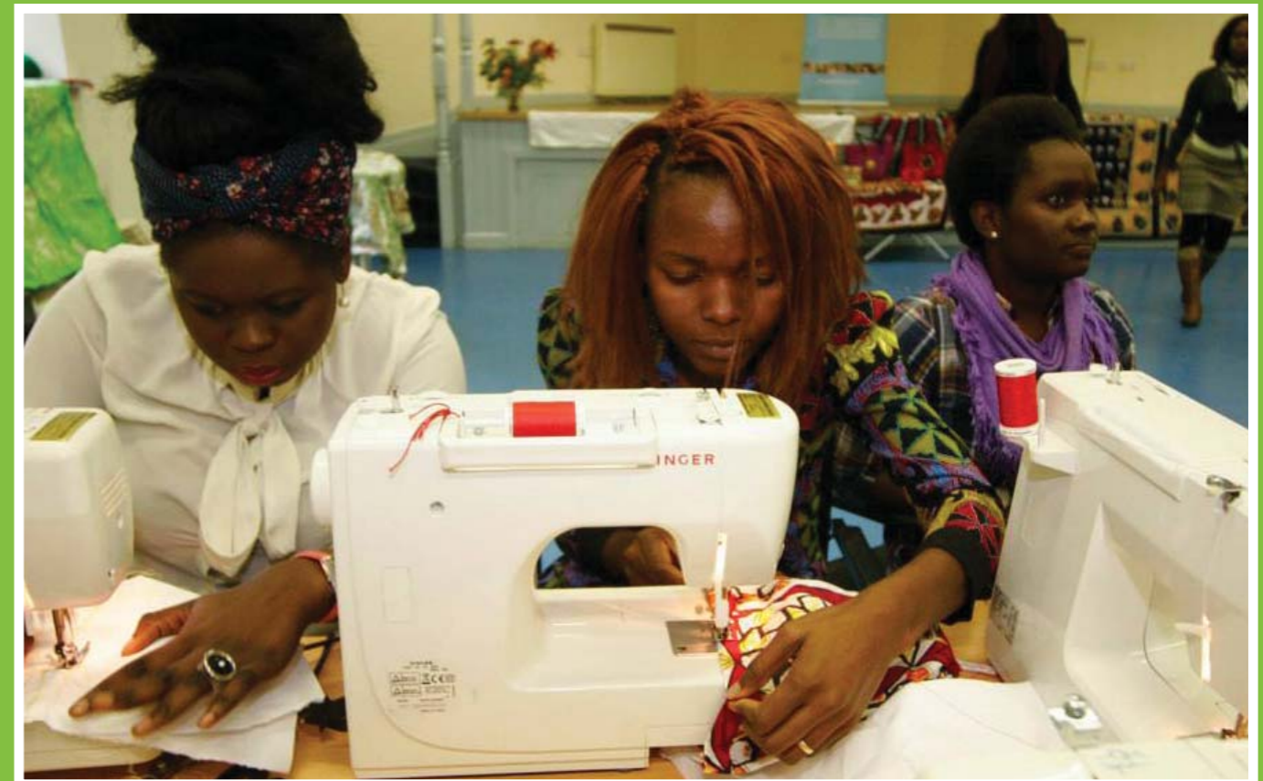
Members of AkiDwA's Young Migrant Women's Group at a dressmaking workshop.