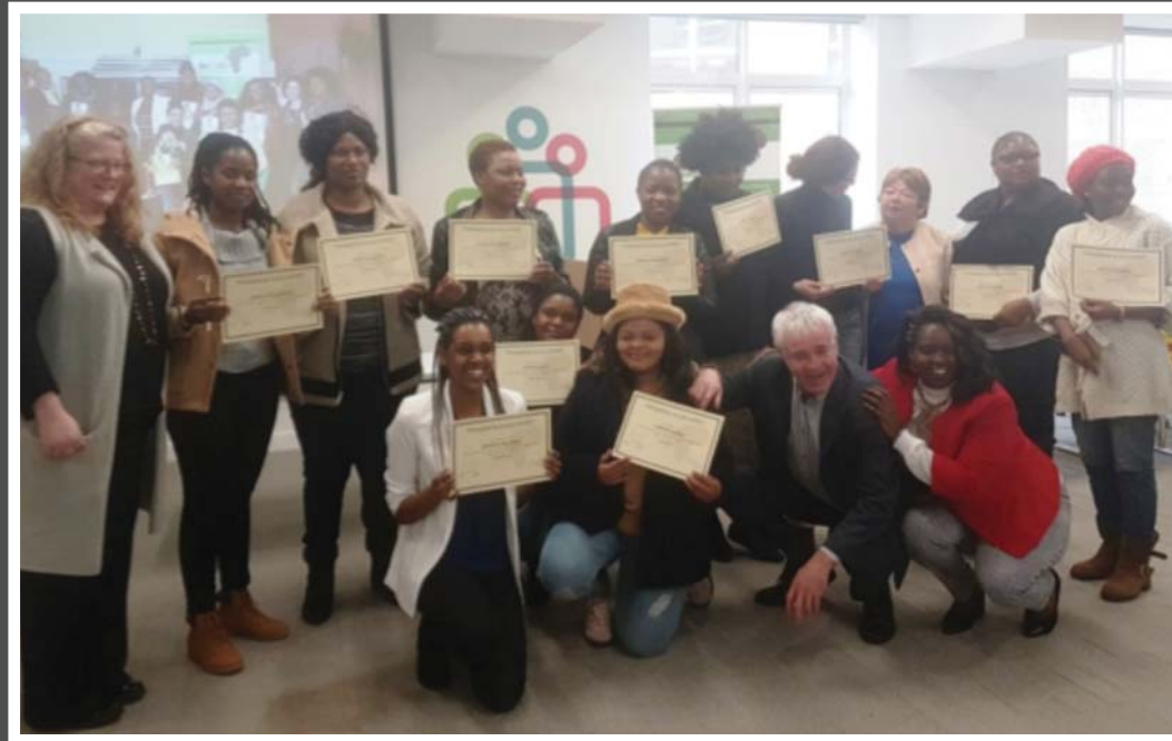
WISE programme graduates receiving their certificates.