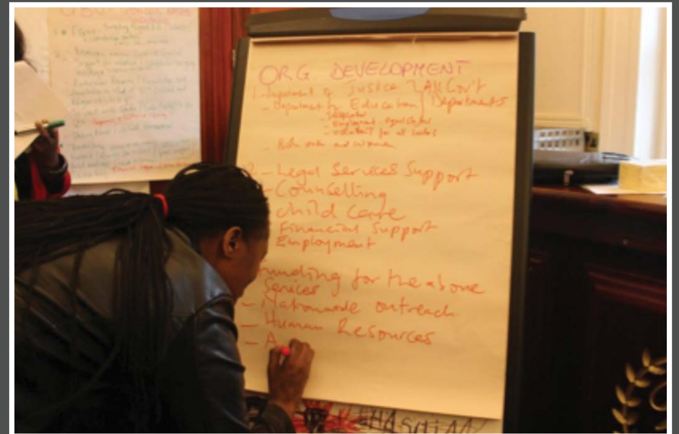
Brainstorming session at AkiDwA AGM 2018.

The Annual General Meeting was held on the 1st of December 2018 at Wynn's Hotel, with the theme Shaping the Future. Members, friends and supporters came from all corners of Ireland to learn about our achievements, challenges, and plans for the future.