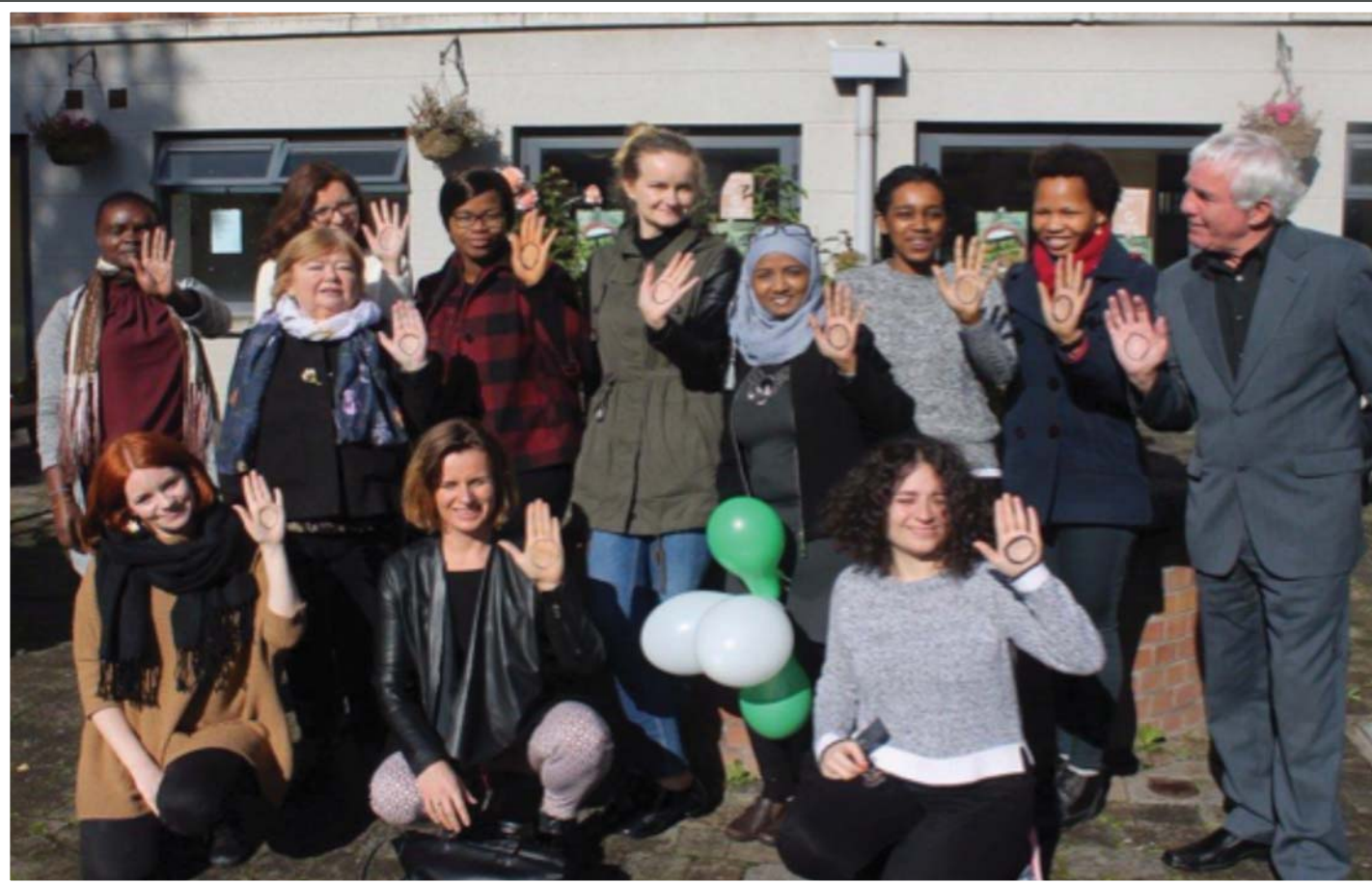
Beginning of Women in Social Engagement (WISE) project by Partners in Catalyst.